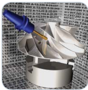
Impeller machining with Pro/ENGINEER

With Pro/ENGINEER Complete Machining, manufacturing engineers can work concurrently with designers to automatically incorporate design changes. With this integrated collaboration between two fundamental areas of development, you have the power to increase product quality, reduce scrap and shave production time and costs.